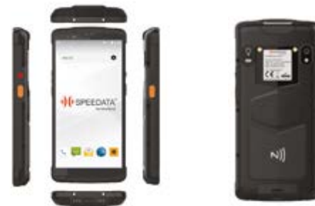
SD55 from all sides